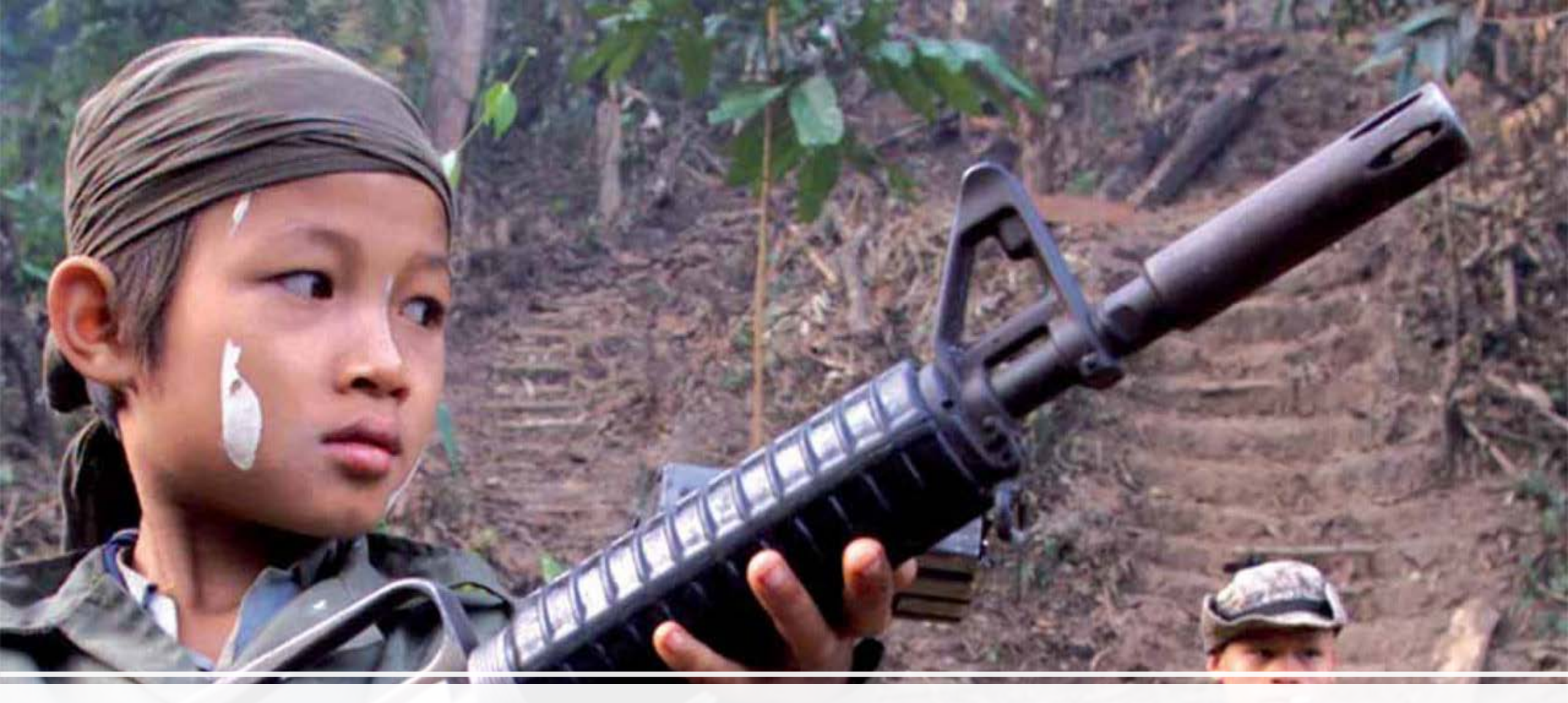
Barriers - Case Study 2 — Child Soldiers