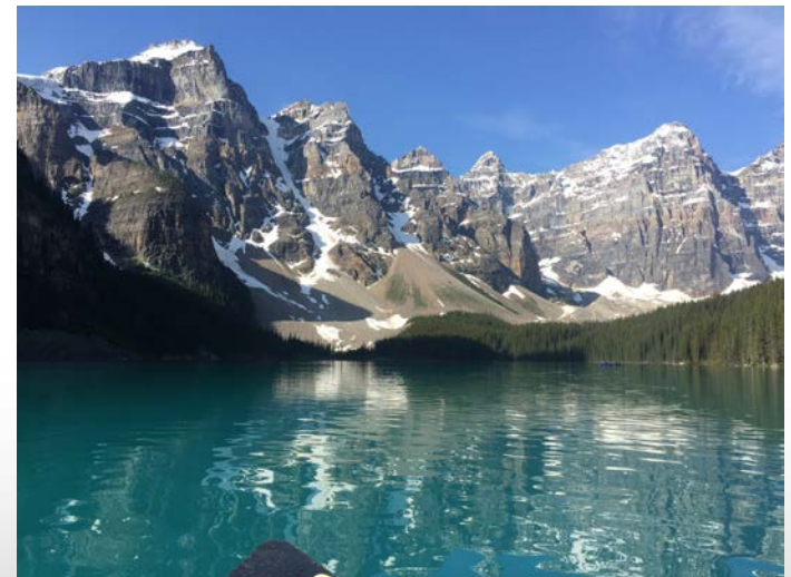
Banff National Park, Canada